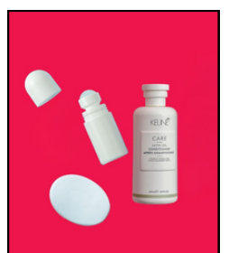
PERSONAL HYGIENE KIT