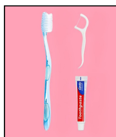
ORAL HEALTH KIT