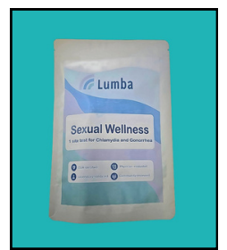
STI AT-HOME TESTING KIT REGISTER & MAIL IN