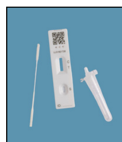
COVID/FLU HOME TEST